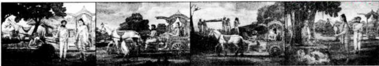
(1) He laughed.